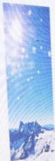
Glare comparison at a 55° illumination angle in vitro**